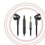
Lenovo 500 Extra Bass In-ear Headphones*