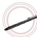
Lenovo Active Pen*