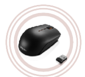
Lenovo 300 Wireless Mouse*