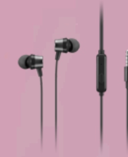
Lenovo Analog In-Ear Headphones Gen II Bulk Package (20pcs) 4XD1T54899