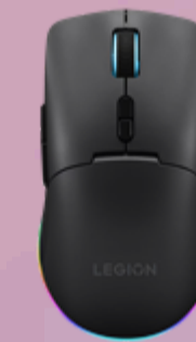
Lenovo Legion M220 Wireless RGB Gaming Mouse GY51U28359

Please click here to view the full list of accessories.