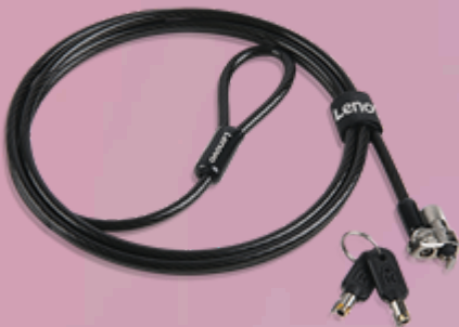
Kensington MicroSaver DS 2.0 Cable Lock from Lenovo 4XE1L68273