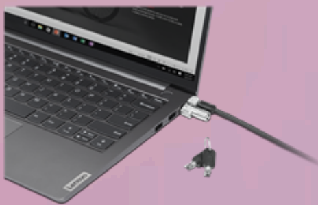
NanoSaver Cable Lock from Lenovo 4XE1L51710