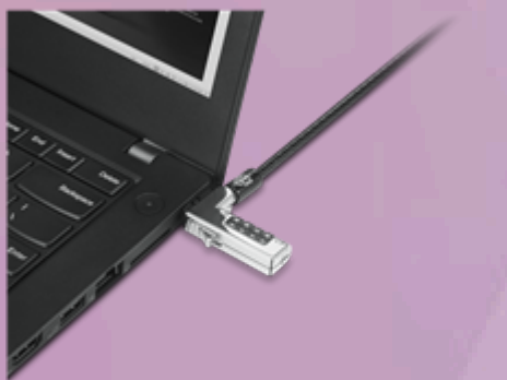
Combination Cable Lock from Lenovo 4XE1F30278

Please click here to view the full list of accessories.