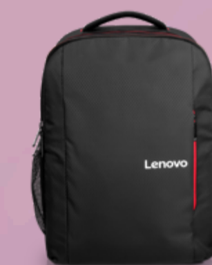
Lenovo 16" Laptop Everyday Backpack B510 4X41U80414

Please click here to view the full list of accessories.