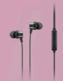
Lenovo Analog In-Ear Headphones Gen II Bulk Package (20pcs) 4XDIT54899