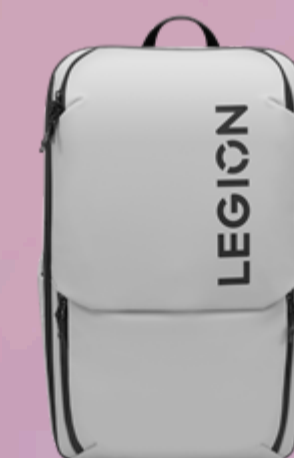
Lenovo Legion 17" Gaming Backpack GB800 (Light Gray) GX41U39300

Please click here to view the full list of accessories.