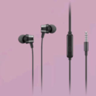
Lenovo Analog In-Ear Headphones Gen II Bulk Package (20pcs) 4XD1T54899

Please click here to view the full list of accessories.