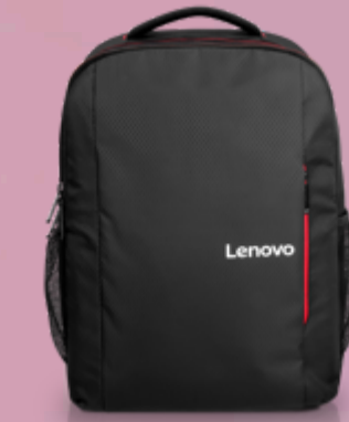
Lenovo 15.6 Laptop Everyday Backpack B510-ROW 4X41U80414