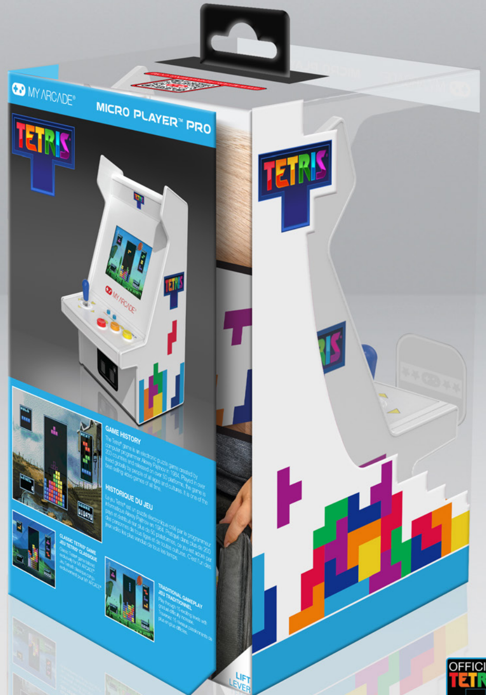
PACKAGING - BACK