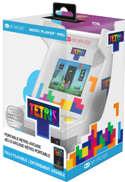
Packaging - Front