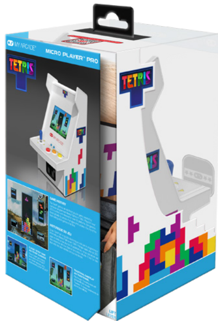
Packaging - Back