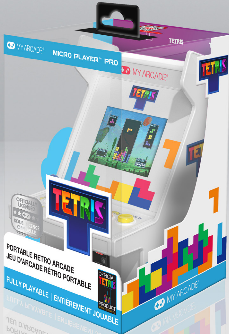
PACKAGING - FRONT