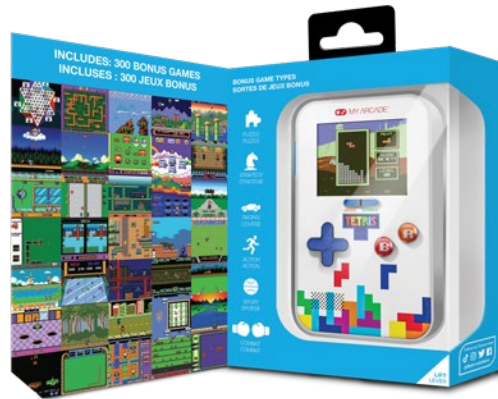
Packaging - Open