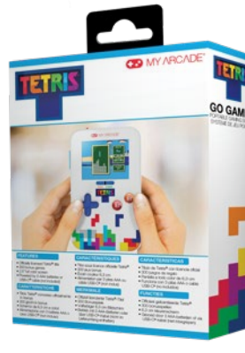
Packaging - Back