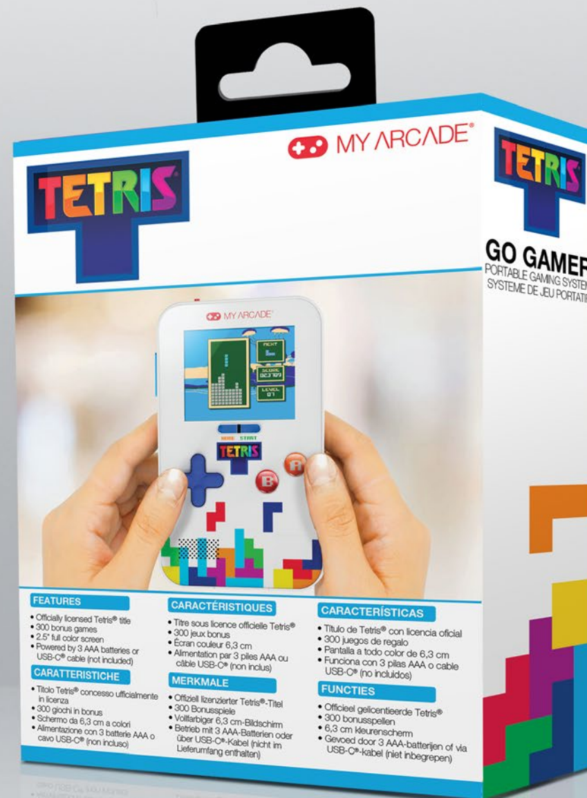
PACKAGING - BACK