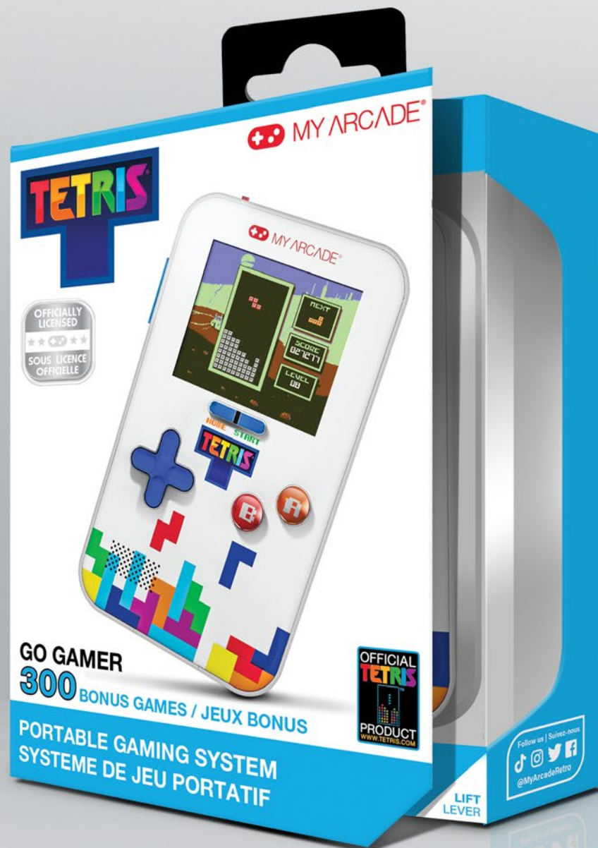
PACKAGING - FRONT