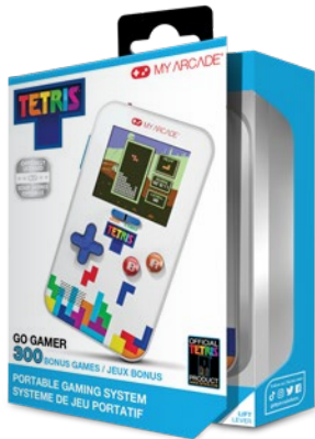
Packaging - Front