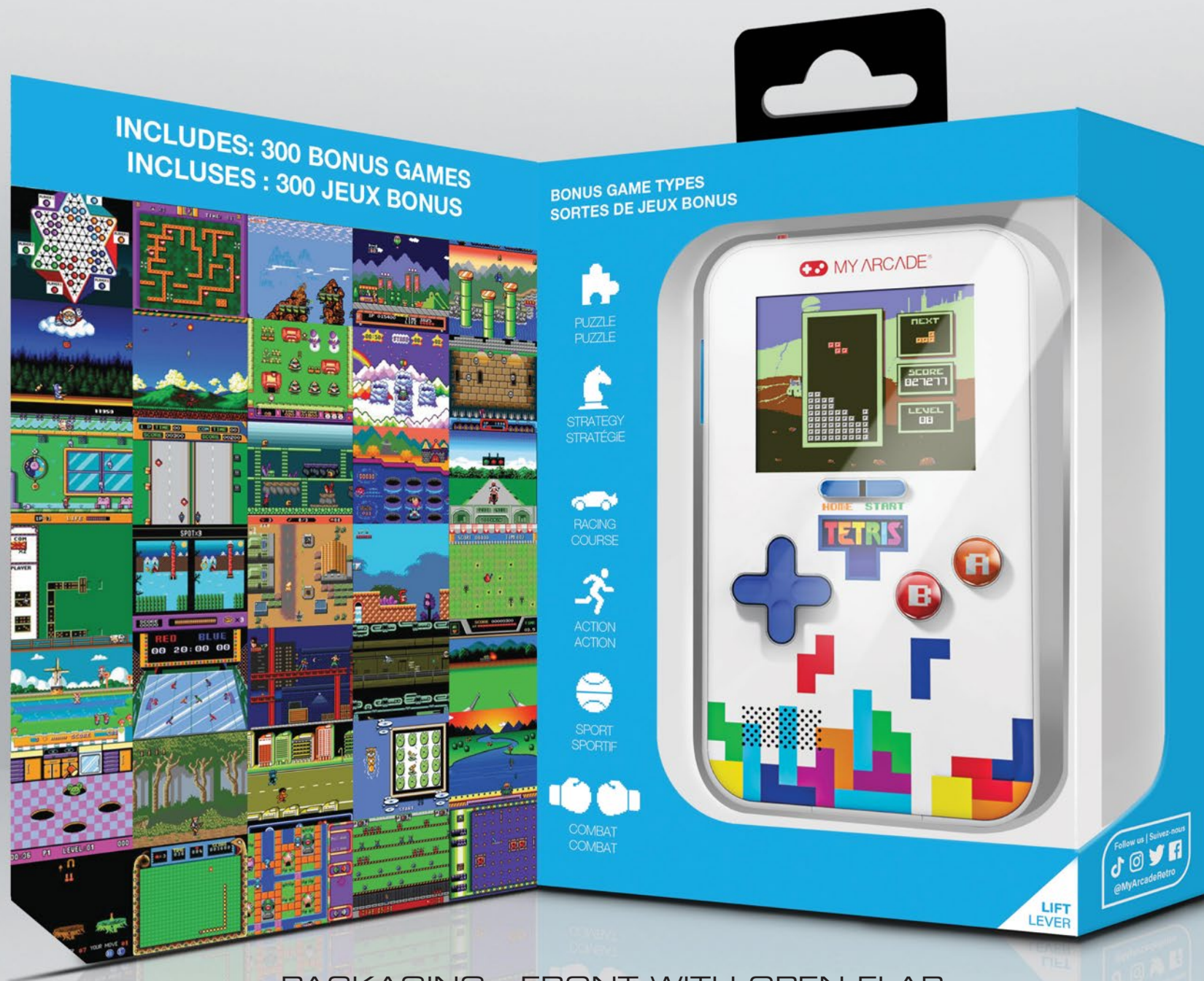
PACKAGING - FRONT WITH OPEN FLAP