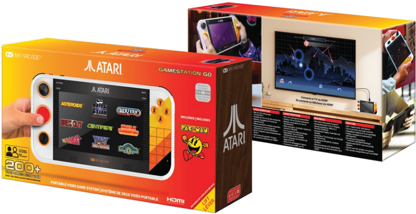
Packaging - Front