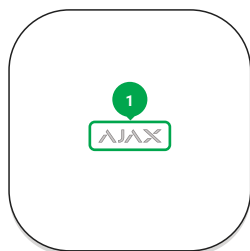
1 - Logo with a light indicator