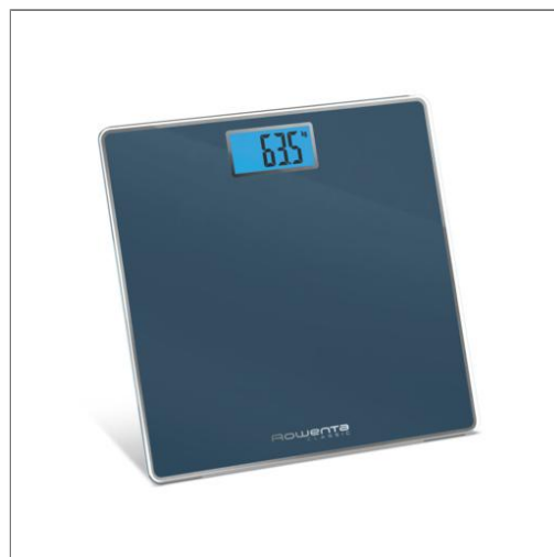
Classic Digital Bathroom Scale, Large Backlit Display, 160 kg High Capacity, Body Weight Scale

Simplicity meets convenience in a stunning design BS1504V0