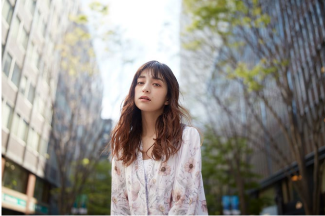
Focal Length: 35mm Exposure: F/1.4 1/800sec ISO: 100

To deliver a perfect image to people who love photography; that's our obsessive goal for all Tamron lenses. The Tamron SP 35mm F/1.4 Di USD (Model F045) is our most shining example. The exceptional image quality of this fast fixed focal lens makes it worthy of being the lens that marks the milestone 40th anniversary of the SP (Superior performance) Series. We wanted to know what kind of lens would result if we focused our accumulated expertise and technologies purely on lens performance in pursuit of image quality. In other words, could we create the greatest Tamron lens ever? All of Tamron's technical competence and new coating technologies have been compounded to finally complete the finest lens in Tamron's history. Uncompromising resolution at wide-open aperture combines with Tamron's distinctive bokeh and superior handling characteristics. Experience its performance for yourself. It will give you a better way to see the world.