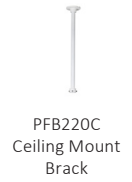
PFB220C Ceiling Mount Bracket